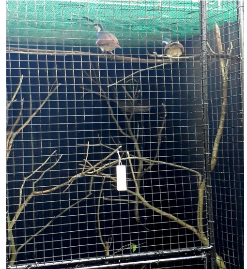
Fig 2. Pair of Gallicolumba keayi perching calmly in their new aviary.

On other note, we would like to mention that we were able to foster two chicks of Negros bleeding heart with a good range of growth, to a pair of Streptopelia roseogrisea. The chicks already jumped from their nest past November 22nd with no visible defect.