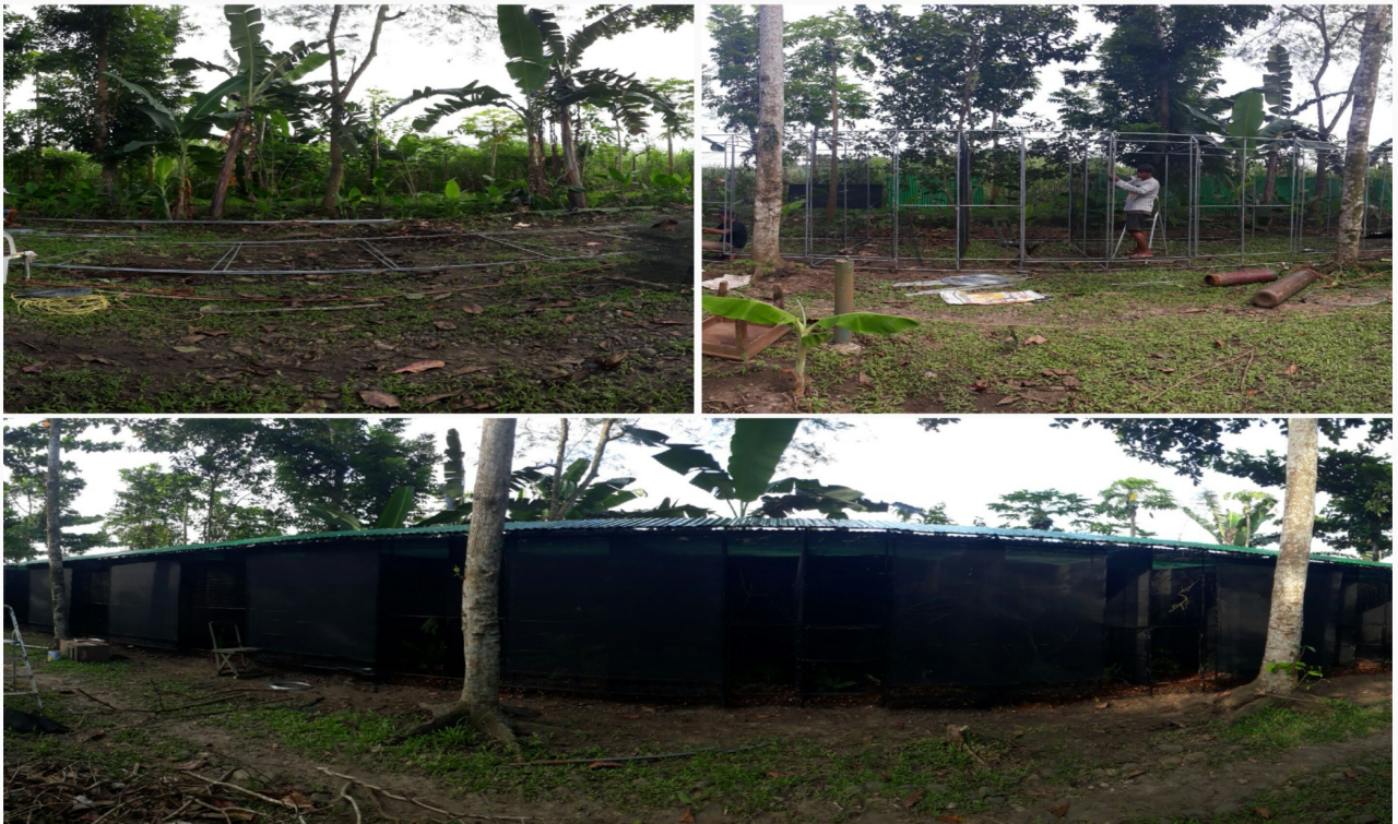
Fig. 1 20 Negros bleeding heart aviaries in Talarak Kabankalan built in 17 days.

Whatever deficit during the construction was readily covered from the pocket of our president Fernando Gutierrez. All the accounting is attached to this email together with the invoices. One of the goals of the new Talarak team is to be transparent in everything we do.