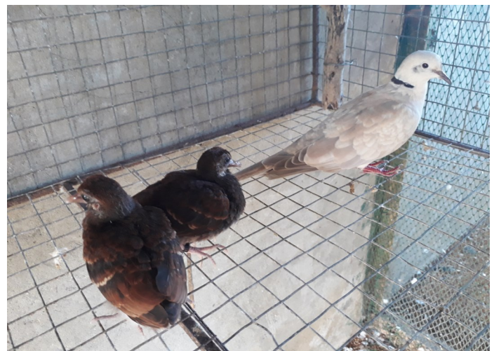
Fig 4. 15 day old chicks.

On other note, we would like to mention that we were able to foster two chicks of Negros bleeding heart with a good range of growth, to a pair of Streptopelia roseogrisea. The chicks already jumped from their nest past November 22nd with no visible defect.