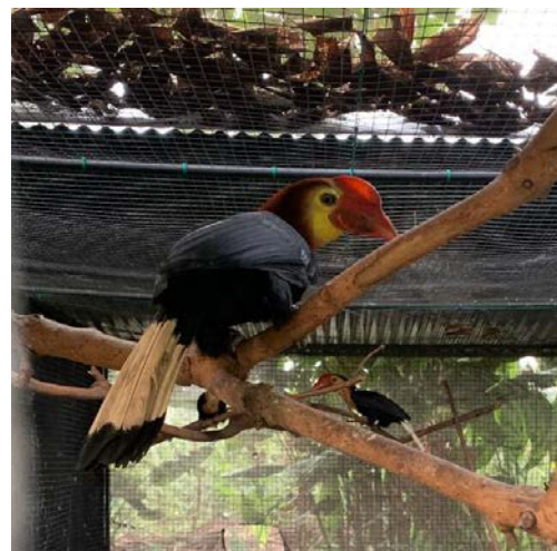
Valentin in his new enclosure in TFI Kabankalan

Valentin has since been moved to the TFI Kabankalan Captive Breeding Centre, where we hope he can soon interact with a different family of Walden's Hornbills.