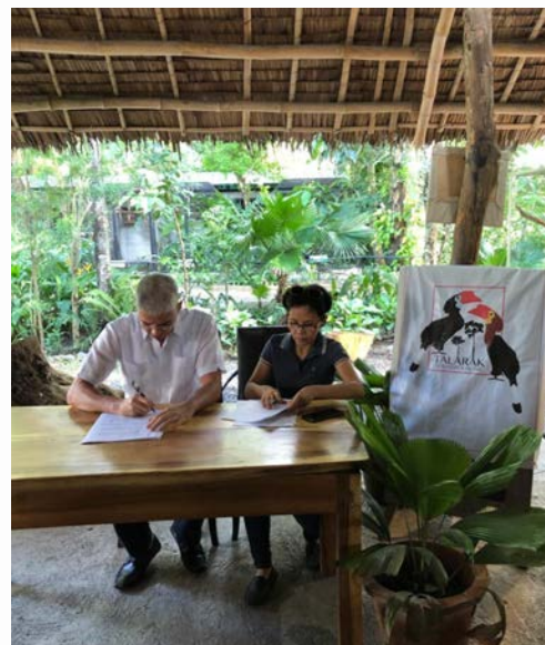
Top Left Photo: MOA signing between TFI and Governor Bong