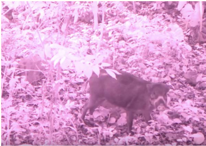
Visayan Warty Pigs caught on the Banban Forest camera traps

In three separate locations in this site, the team was able to capture footage of Visayan Warty Pig family groups, making this a very promising discovery for our much-needed research. The footage also captured domestic animals, which proves human activity is very much present in this area.