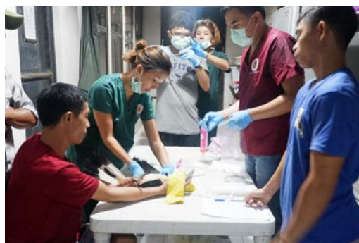
Collecting samples from NFP's birds