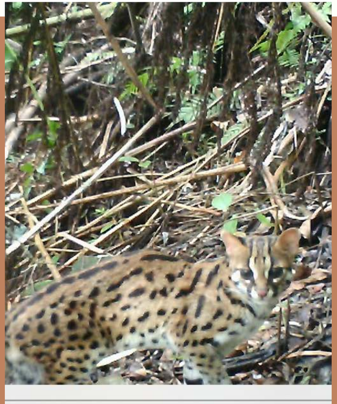
A Visayan Leopard Cat on camera trap footage

Sadly, through their surveys and research, the team has also discovered multiple animal traps, evidence of poaching and killing of the Tarictic Hornbill, and much evidence of human activity within the protected areas.