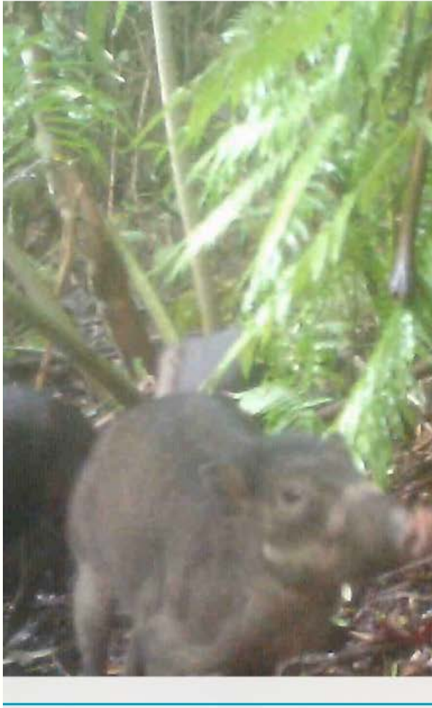
A Visayan Warty pig caught on a camera trap at BTLNP