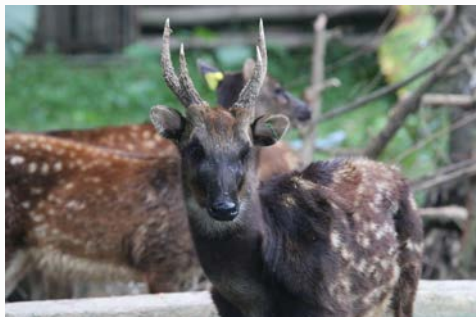
A male Visayan Spotted Deer, one of our key species that will be housed at the Danapa Nature Reserve