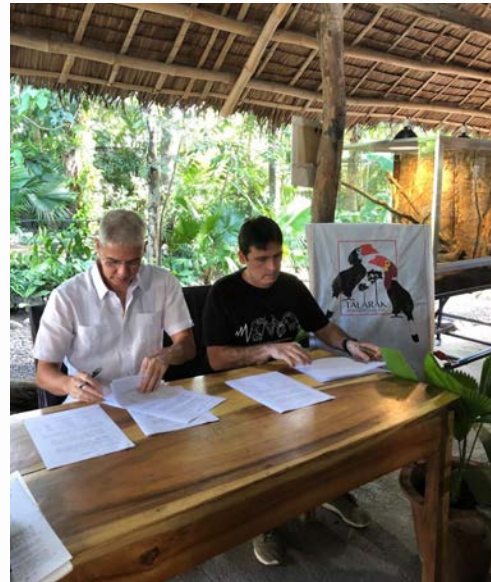
Leftmost Top Photo: Members of TFI, ANP and the Provincial Government

Not only will this new partnership bring more visitors to the Negros Forest Park, we hope to create an educational hub where we can teach the future generation about the importance of our endemic flora and fauna, and why we must preserve and conserve our environment.