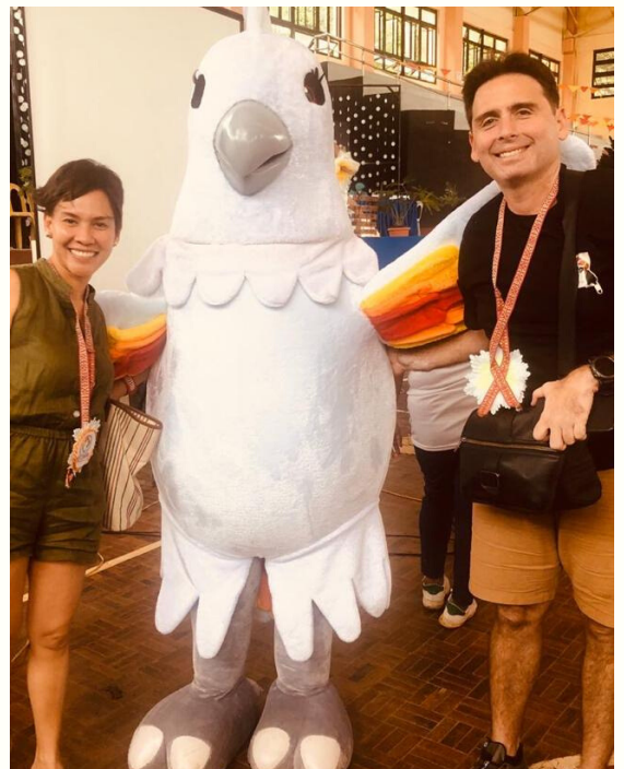
Top Left Photo: TFI team with the Katala Foundation team at Rasa Island

The Philippine Cockatoo was once widespread throughout the country. Due to poaching and the illegal wildlife trade, these birds can only be found on the last strongholds in Palawan. We dream that one day, these birds can be seen on the island of Negros, and that all our endemic animals will be safe from poaching.