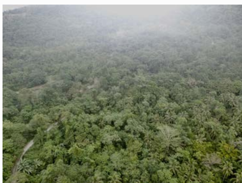
Aerial view of the Danapa Nature Reserve in Bayawan City, Negros Oriental