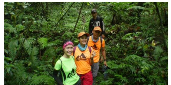
Volunteers at the SWEEP walk in Tinagong Dagat

We believe every month should be wildlife month!