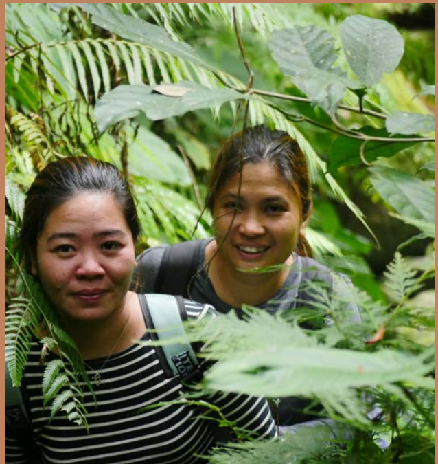
TFI team in the field at Gawahon, Victorias

The camera traps have revealed populations of the Visayan Warty Pig, Emerald Doves, Red Jungle Fowl, Asian Water Monitor Lizard, Visayan Leopard Cats, and Asian Palm Civets. We have yet to see evidence of the Bleeding Hearts, but the findings have been very exciting! With full support from the City of Victorias, we are confident that we can further develop more protection efforts for this section of the NNNP.