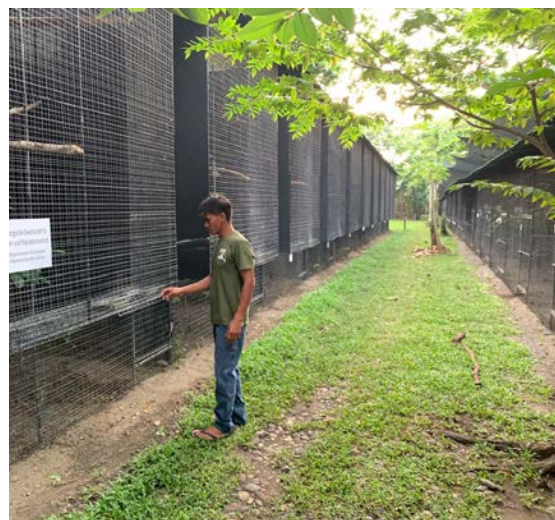
Top Photo: Visayan Warty Pig enclosure